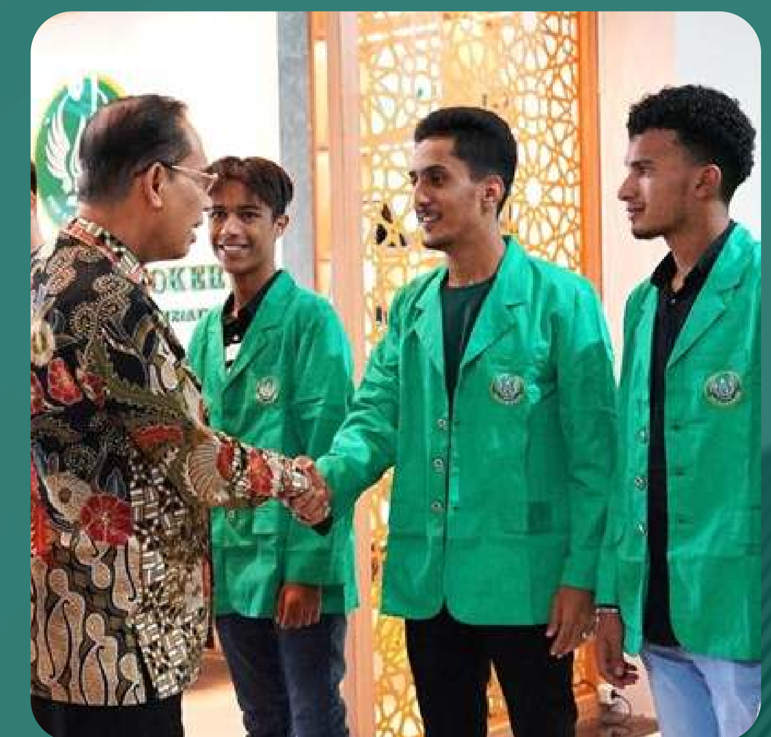
Orientation Program and Academic Advising