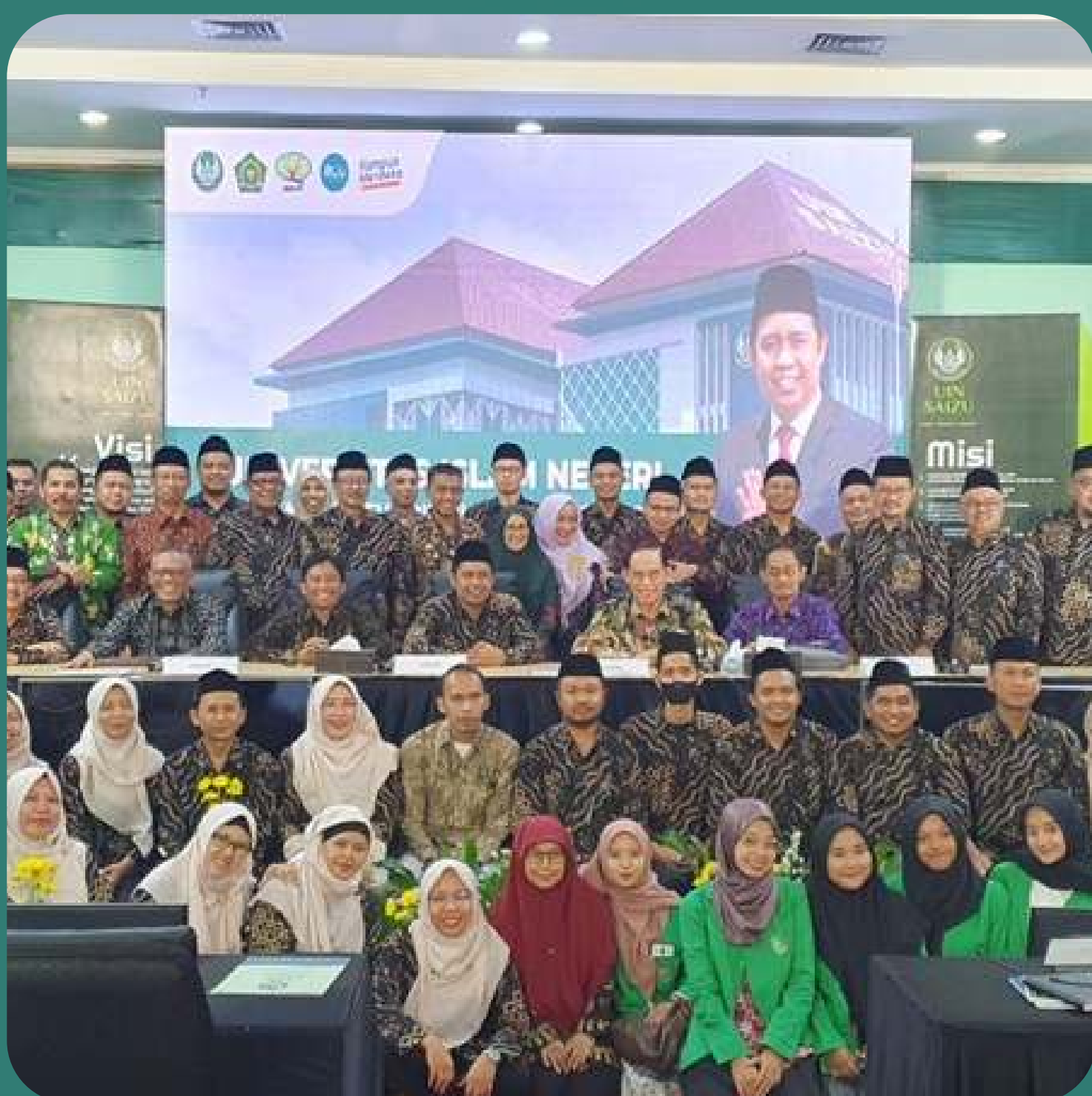
Workshop and Seminars