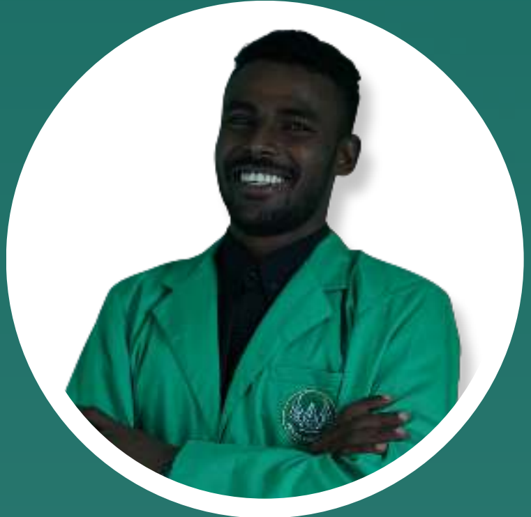
AITAYEB – SUDAN

"The facility in UIN SAIZU are very accomodating. I don't have to worry about transportation, dormitory, and other things because it always been accesible and affordable."