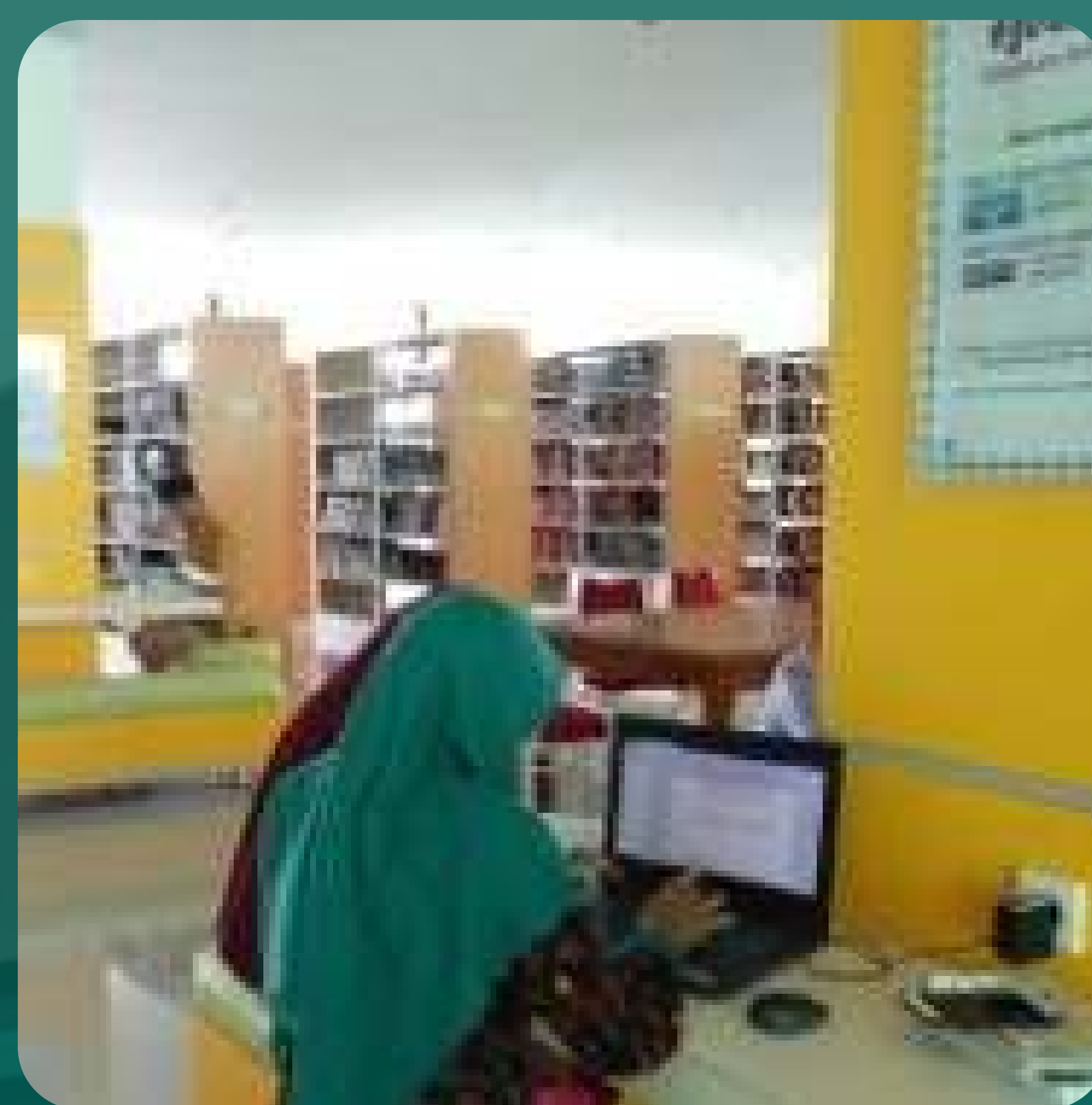
Extensive library with digital resources