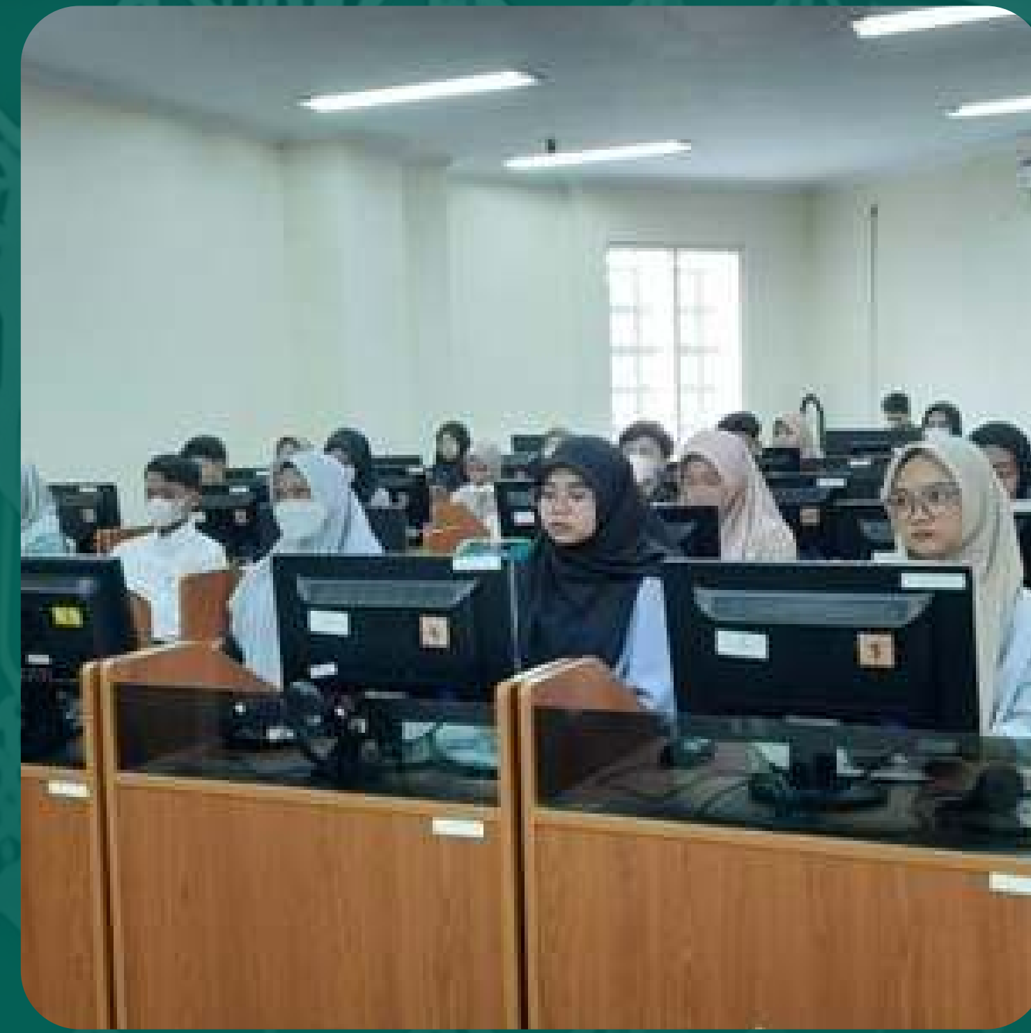
Research centers and laboratories