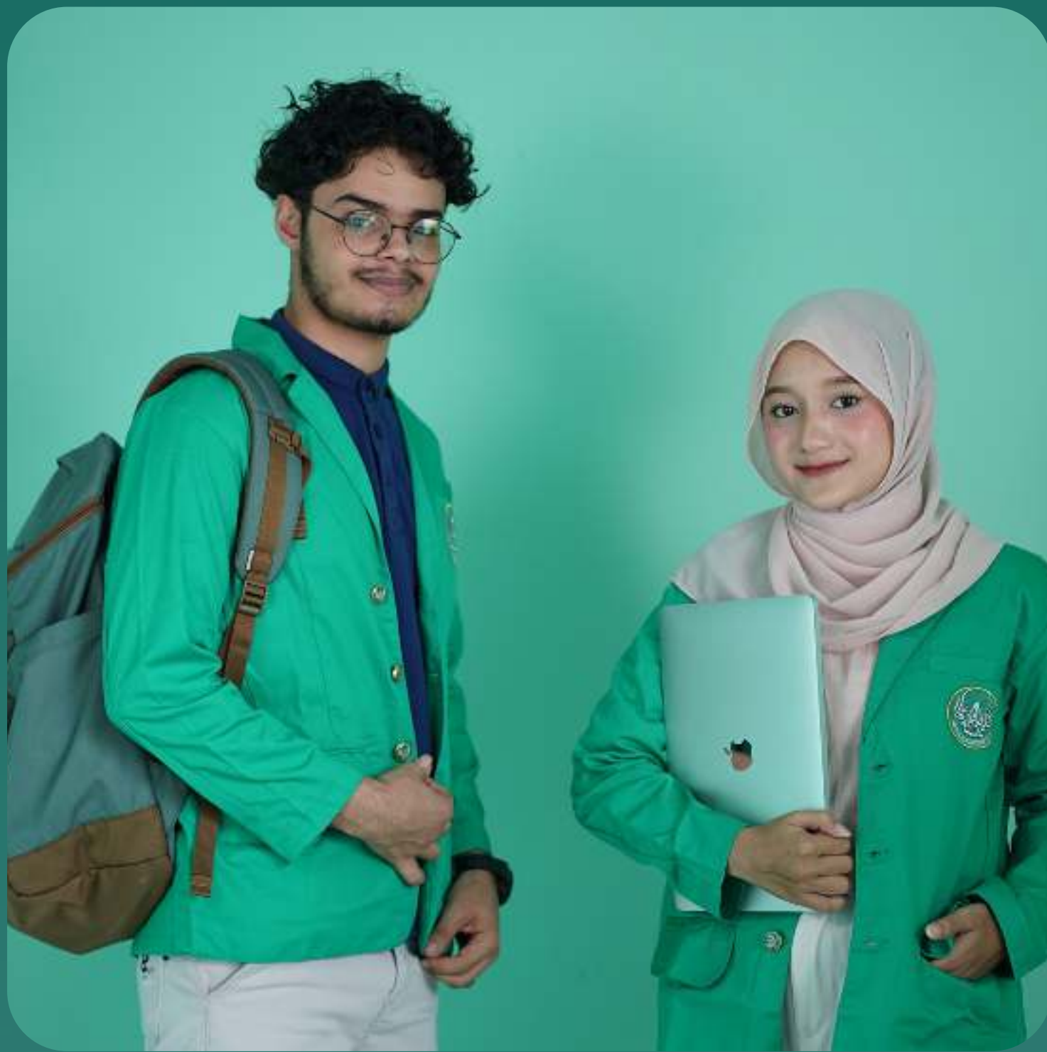
Scholarship for international Student