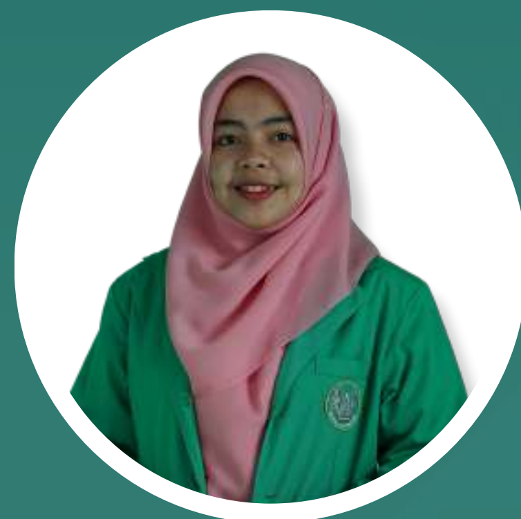
RUHANE – THAILAND

"The facility in UIN SAIZU are very accomodating. I don't have to worry about transportation, dormitory, and other things because it always been accesible and affordable."