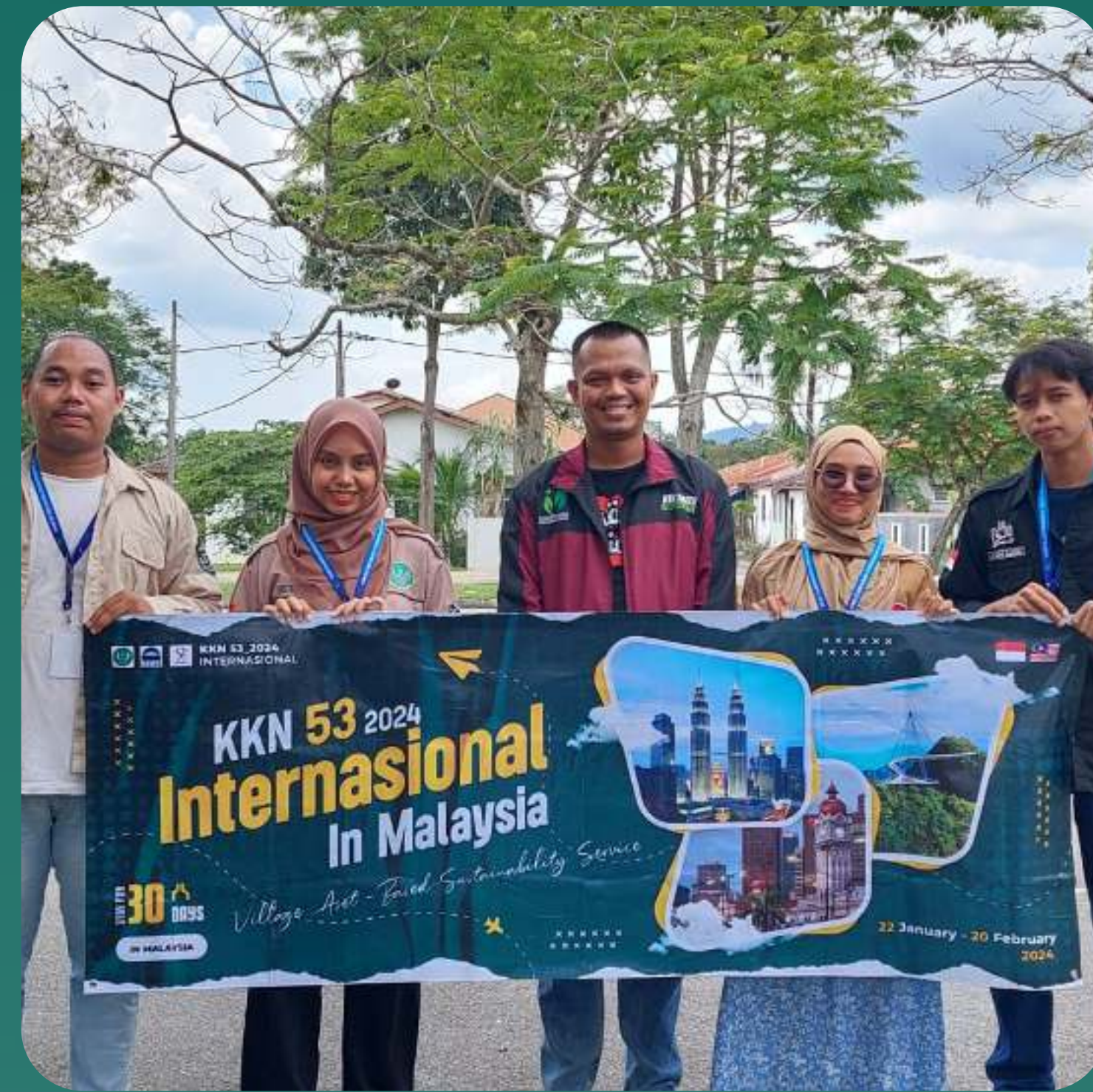
Outreach programs and community service