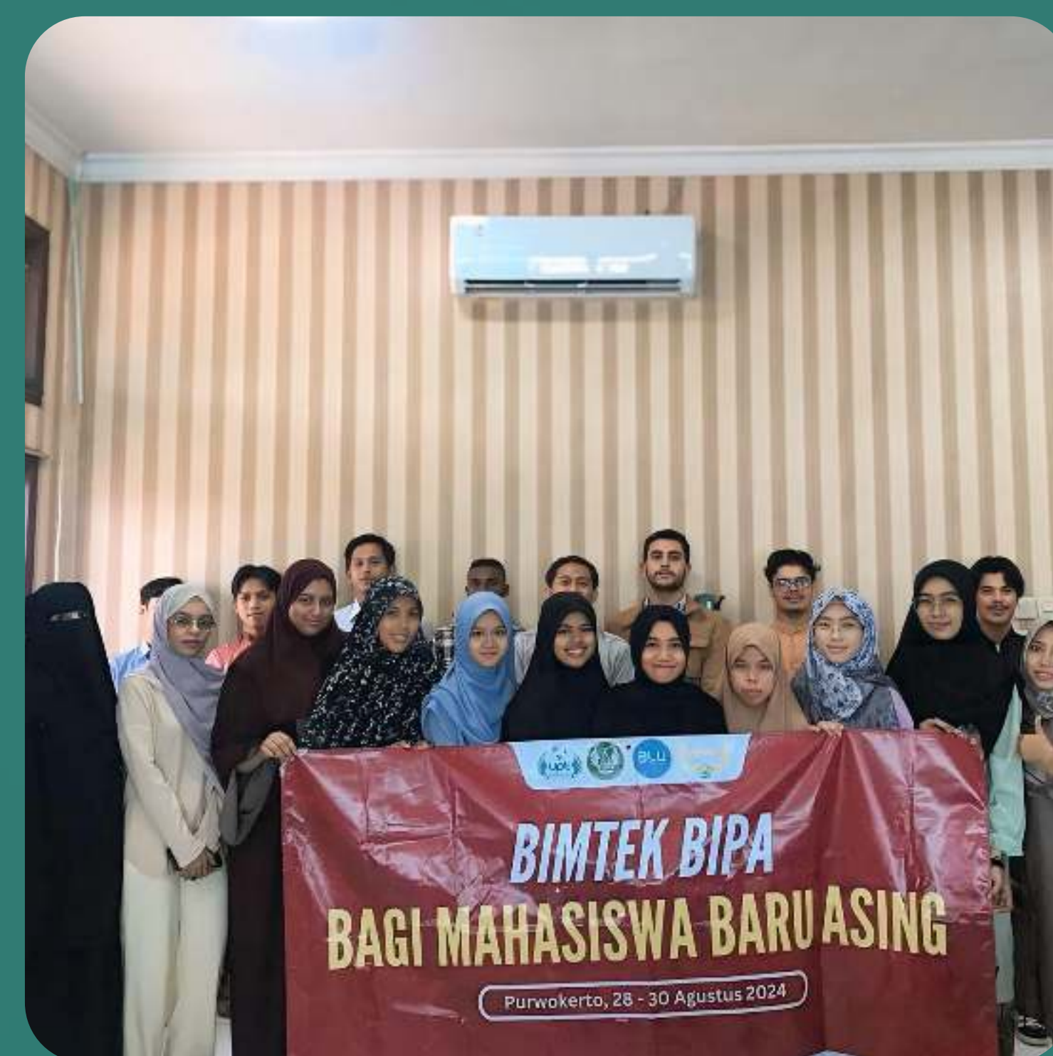
Indonesian Language Course ( BIPA )